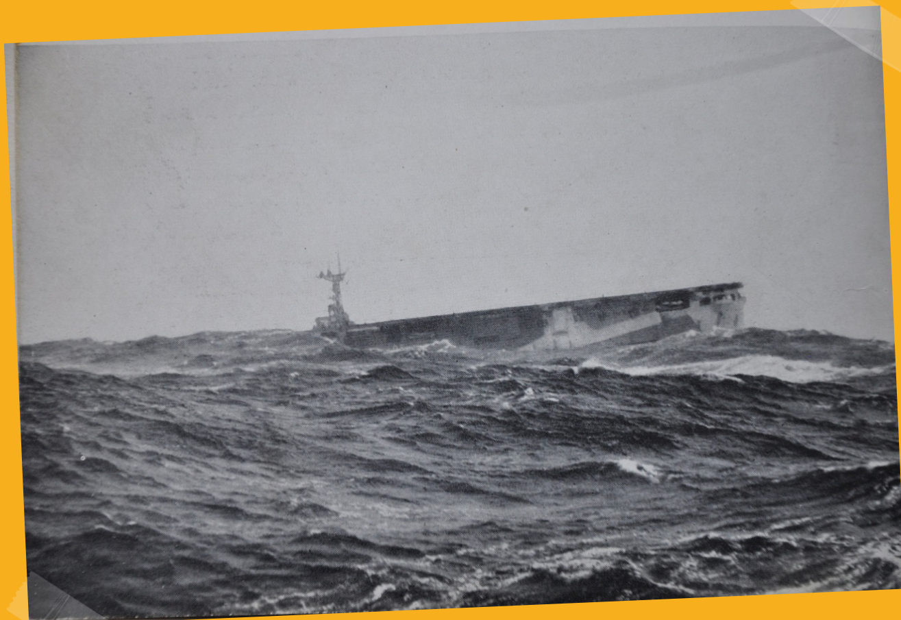
Escort Carrier in a gale

The conditions weathered by RA64 were reported to be the worst endured in the entire North Atlantic theatre. The convoy was hit by two hurricanes. HMS Campania rolled 45 degrees each way and equipment and men were flung in all directions. There was concern about leaking fuel from motors and other equipment that had been upended. It was a harrowing experience.