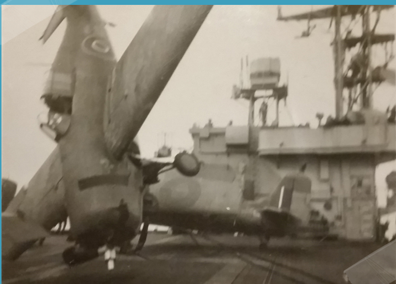
A Wildcat crash beyond the barrier on HMS Fencer

For this operation 842 Squadron was embarked with 12 Swordfish II and 8 Wildcat IV