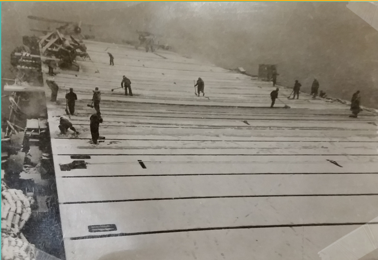
HMS Fencer in April 1944

15 bombs struck the Tirpitz, and the crew suffered heavy casualties. Nevertheless, the ship did not sink, and by mid-July was repaired.