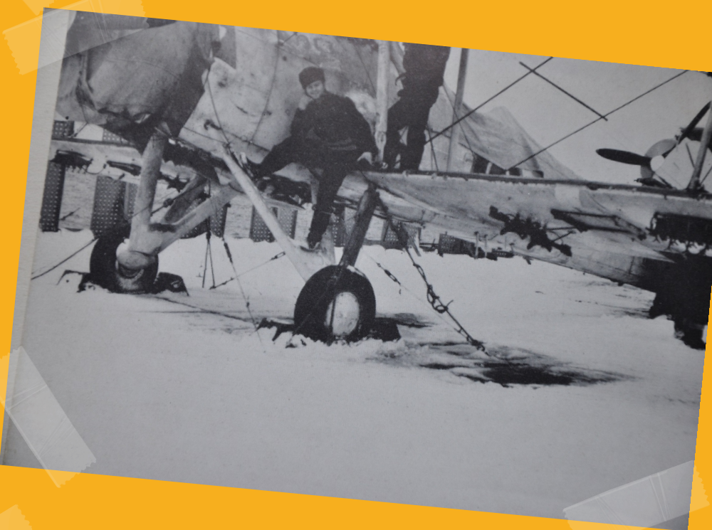
A Swordfish pilot awaiting orders