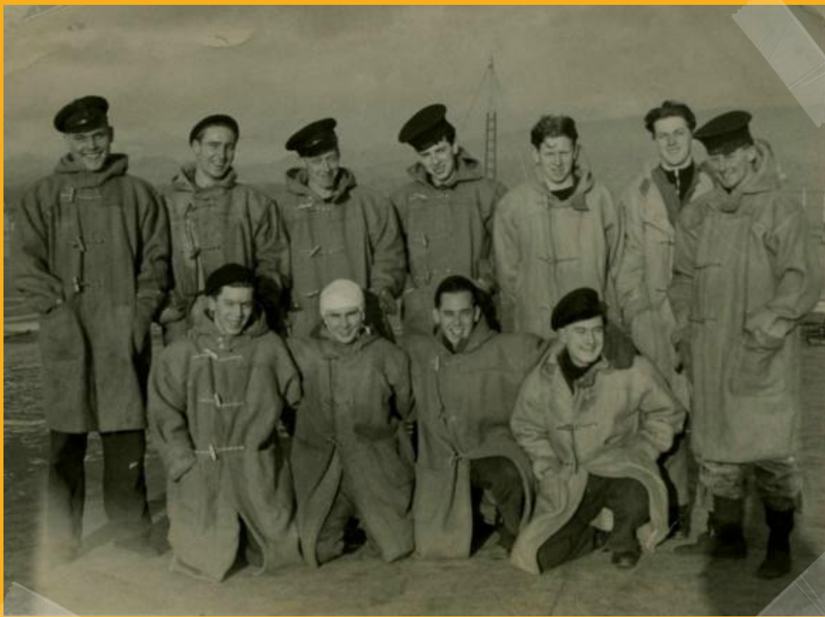
835 Squadron mechanics en-route to Murmansk on HMS Nairana

Towards the end of 1944 HMS Nairana was based at Scapa and they did 3 return convoys to Murmansk (Vayenga) – JW61, 62 & 64 and RA61, 62 & 64. HMS Nairana made history by flying a fighter at night.