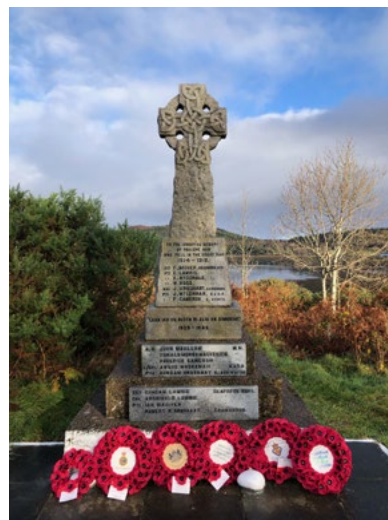
Wreaths at the Poolewe Memorial

The tragic events in Ukraine are a daily reminder of the futility of war. Therefore, the Memorial will reflect the entirety of losses in the Arctic Convoys, at sea and in the air and, significantly, from both sides of the battle. This will not take anything away from the existing Convoy memorial at Cove, which will remain the centrepiece for our annual May event, but it will provide a readily accessible focus, year-round, to