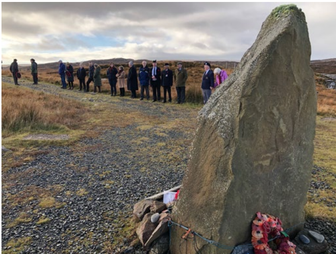
Cove Memorial Service

We were happy to participate and lay wreaths at both services held respectively at the Poolewe Memorial and Rubha Nan Sasan Arctic Convoy Memorial, Cove. These services are arranged by the local Community Council and demonstrate the continued efforts to remember those who served aboard the convoys.