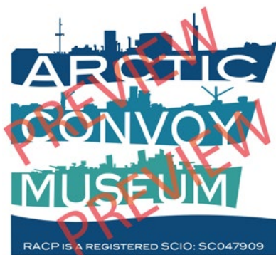
Proposed new logo

This is an exciting time for the future of the Museum. We will keep you posted on developments and thank you for your continuing support.