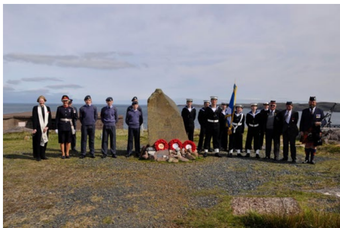
The parade at the memorial stone

On Saturday the 13th of May we held a memorial service at Rubha Na Sasan, site of the Russian Arctic Convoy Memorial stone. We were delighted to be supported by Cadets and the local community. We hope to see everyone again next year.