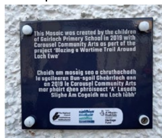
The Plaque at Gairloch Primary

Last year I mentioned that the mosaics made with the help of the Banaluib, Gairloch, and Poolewe primary schools, had been awarded the Grand Prix in a competition held in 2020 by the Northern Convoys