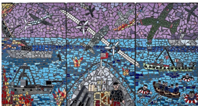
The mosaic designed with pupils of Gairloch Primary

Despite the difficult economic conditions affecting the spending power of many, the museum had another record year, with income up 15% to £64,500 and visitor numbers up 3% to 7518. The museum also received donations totalling £4,561. The visitor number growth was smaller this year as tourist numbers to the region have suffered from higher fuel costs. This year we increased the entrance fee to £6 which has contributed to our income growth performing better. Overseas visitors continue to increase and the comments in our visitor book remain overwhelmingly favourable. Perhaps as a reflection of this, the museum received a Travellers Choice award from Trip Advisor, which mentioned that the museum was in the top 10% of most commented-on visitor attractions globally, not bad for a small outfit in a remote but beautiful part of the UK!